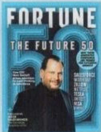
▲ ON THE COVER: PHOTOGRAPH BY SPENCER LOWELL