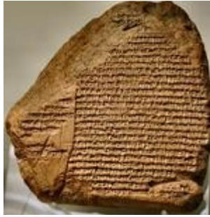
An image of the Nabonidus Chronicle.

The Nabonidus Chronicle says the following.