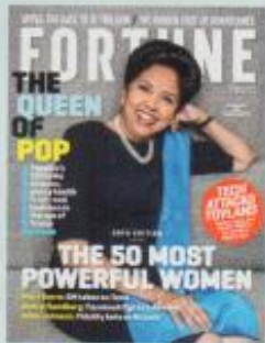
▲ ON THE COVER: INDRA NOOYI