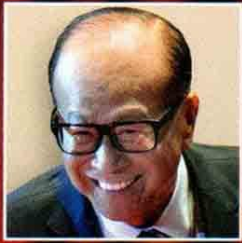
LI KA-SHING UP $5.7 BILLION