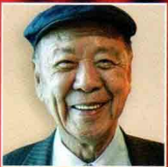
LUI CHE WOO UP $7.8 BILLION