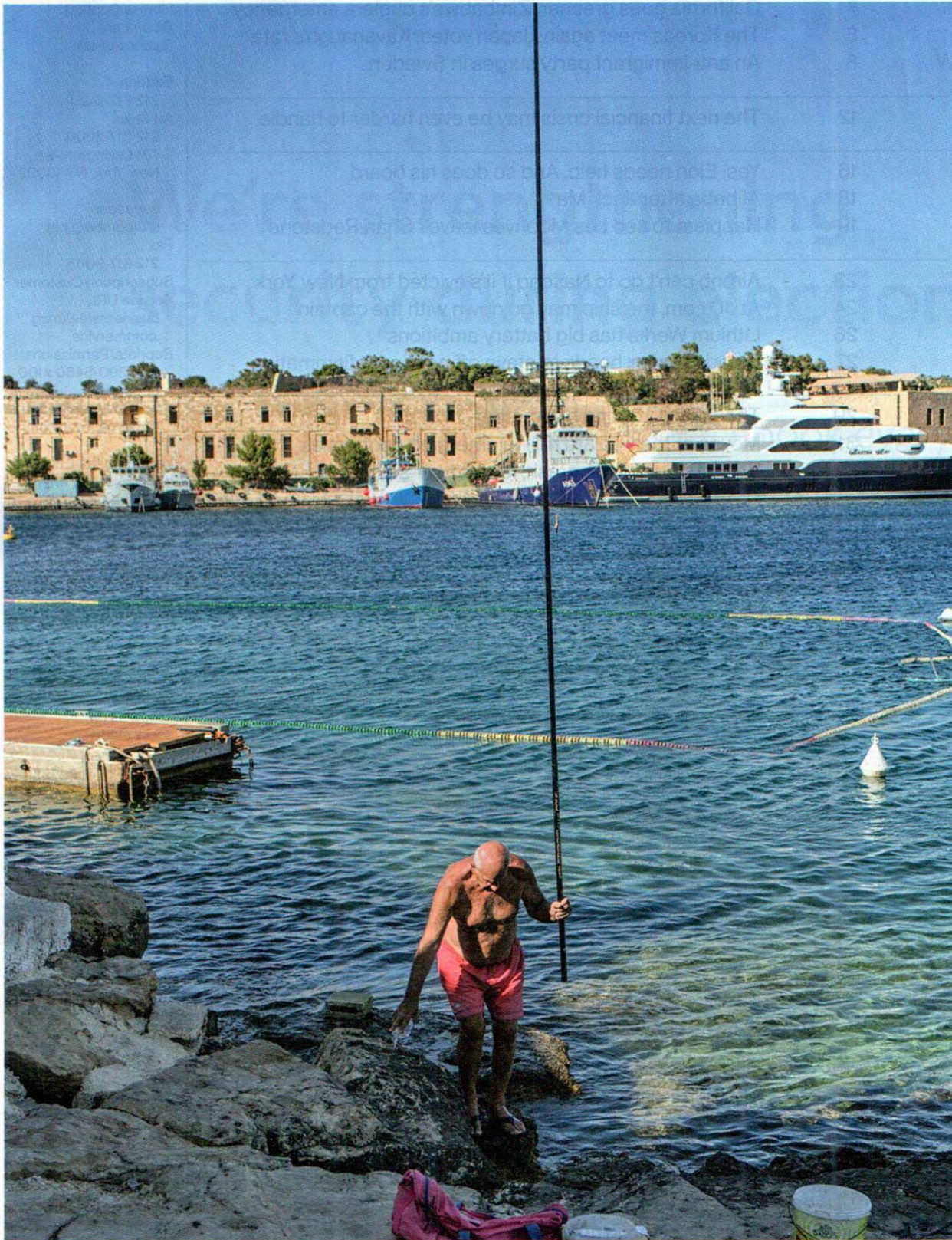
◀ A man fishes in the harbor at Ta' Xbiex, Malta