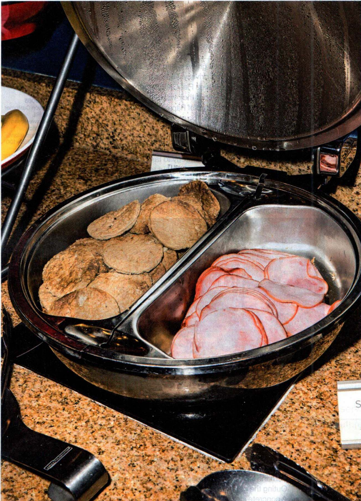
◀ Breakfast at a Fairfield Inn—a Starwood fan's worst nightmare