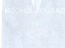
Cover: Sim On Yeh Magnus Photos