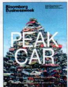
Cover: Photo illustration by Justin Metz. Photos: Shutterstock (4)

Facebook facebook.com/ bloomberg businessweek/ Twitter @BW Instagram @businessweek