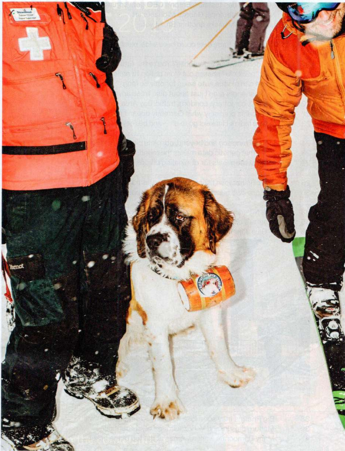
◀ Powder, the mascot at Alterra's Steamboat resort