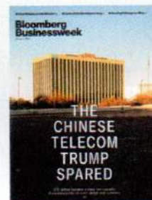
Cover: ZTE's U.S. headquarters in Richardson, Texas.