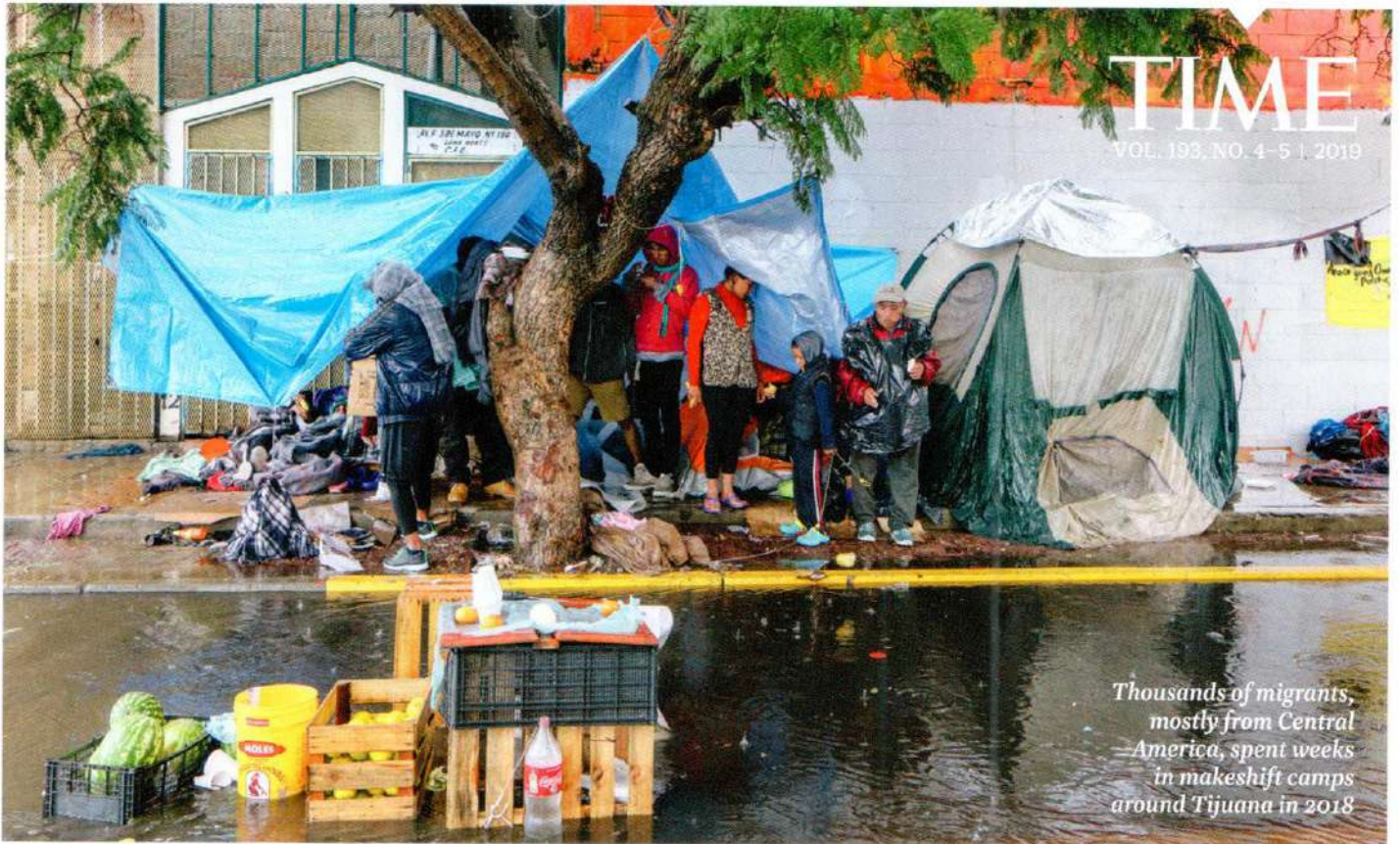
Thousands of migrants, mostly from Central America, spent weeks in makeshift camps around Tijuana in 2018