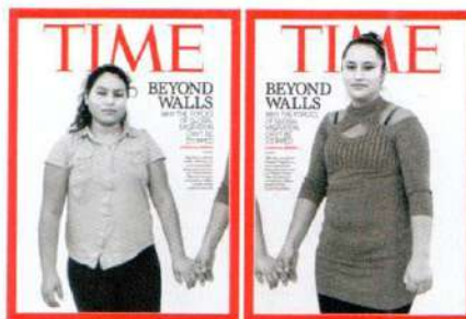
ON THE COVERS AND ABOVE